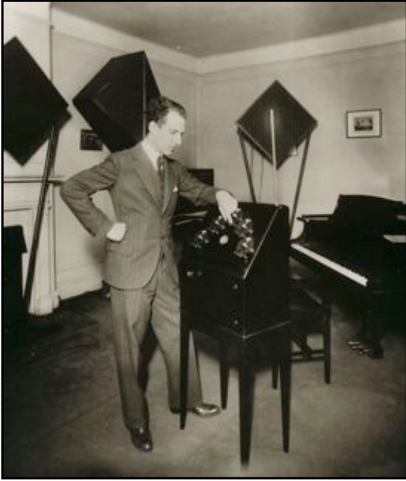
Leon Theremin in his studio