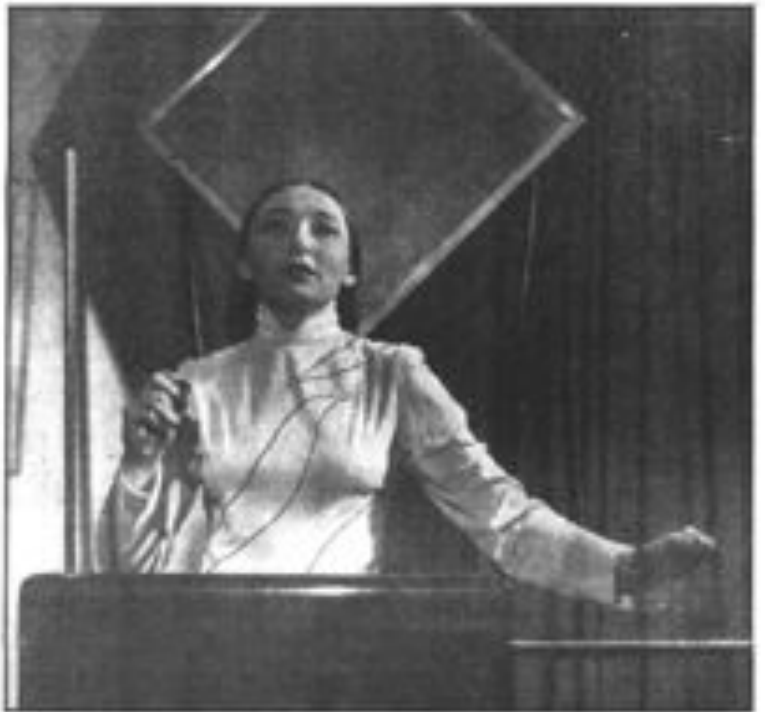
Clara Rockmore, demonstrating the Theremin, with her antenna suspended by a wire from the ceiling.